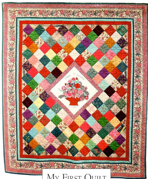
MY FIRST QUILT

Theme: I'm not a sprinter, but I'm a runner. I run for different reasons – out of habit, to sort my thoughts, to elaborate on ideas, to tackle problems, to calm down, to experience physical exhaustion. I leave a lot of things behind. I find a new perspective on things. I can determine goals more clearly. To me running is a freedom, running allows me to break free from the stress and restrictions of everyday life