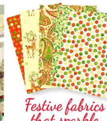
Festive fabrics that sparkle